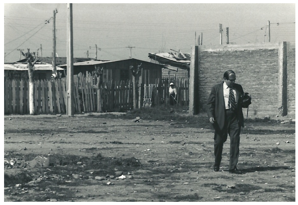
Dr. Sidel was invited to Chile in 1979 by the Catholic Church for a peaceful protest of the Chilean military government.